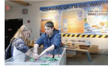
Tsunami Wave Challenge