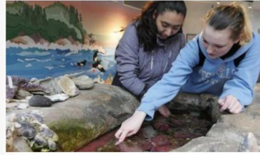
Tidepool Touch Tanks

The Visitor Center has welcomed visitors to learn about marine species, research and the coastal environment since 1965.