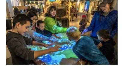
Augmented Reality Sandbox